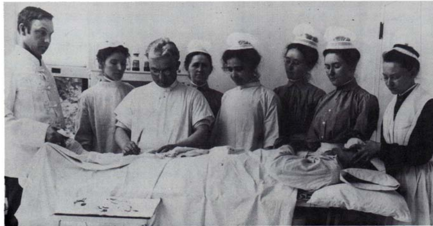
The operating room of Springfield Hospital in 1903